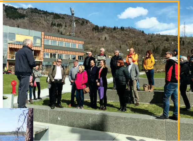
Norway, spring 2017