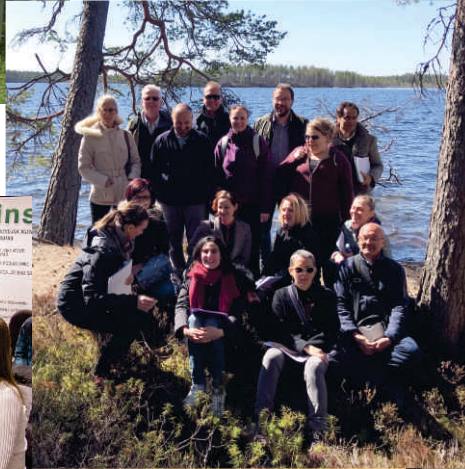
Finland, spring 2018