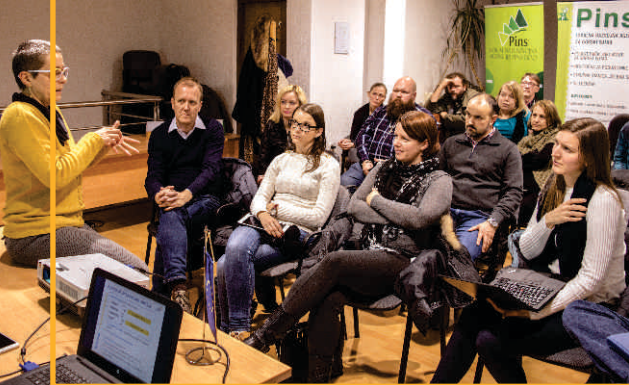
Croatia, winter 2017