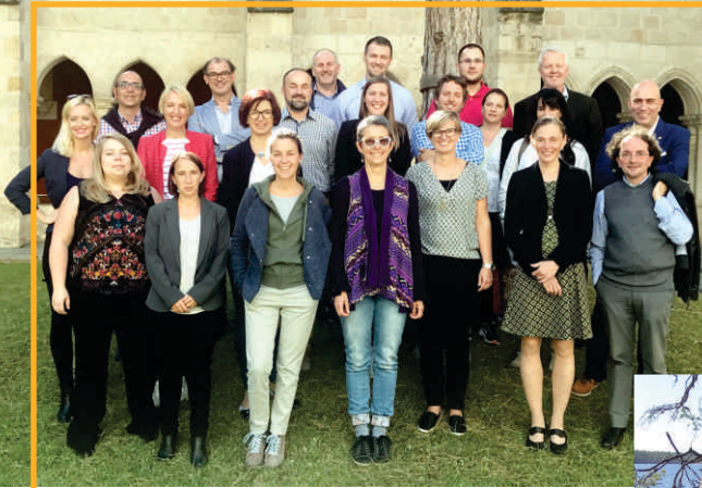
Spain, autumn 2017